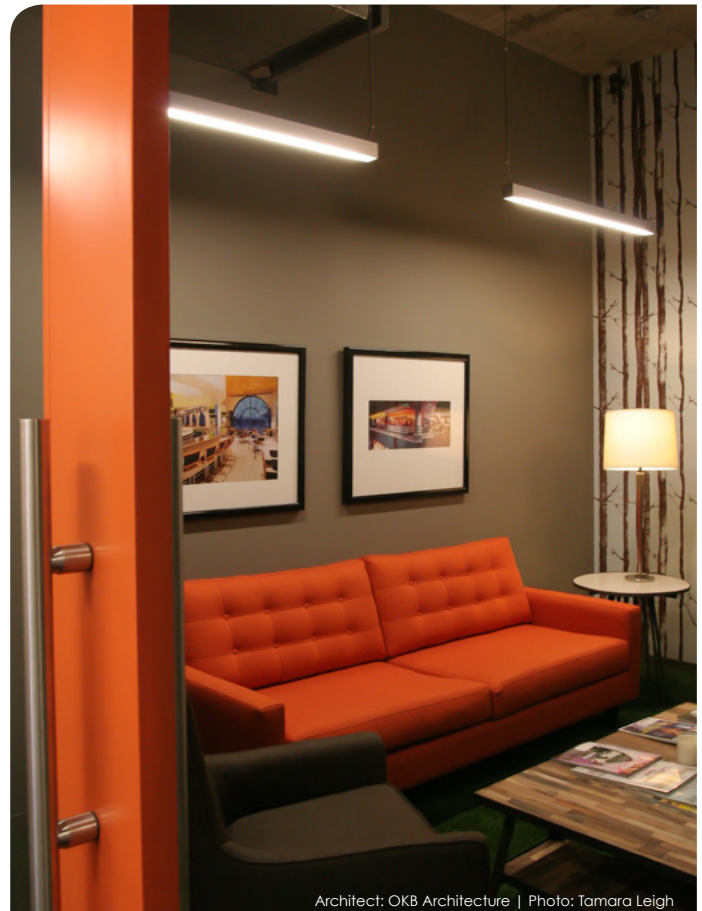
KELSEY 225 CSS