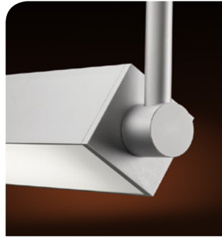
KELSEY 225 RAS Rotational Arm System