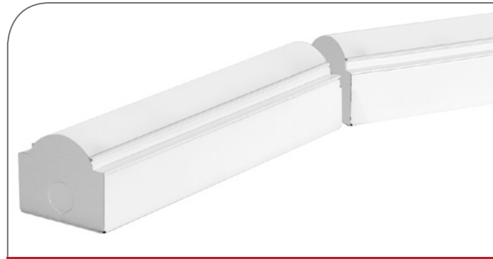
SYDNEY LED (EE)