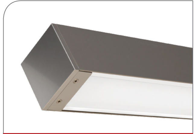
VANESSA bottom view